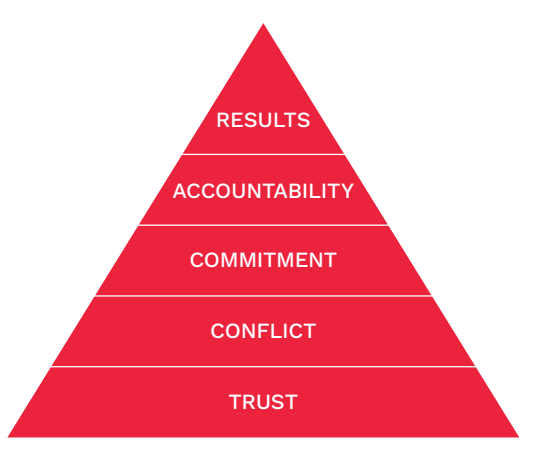
The Five Behaviors Model

The experience is completed through a half-day training session, led by a trained Five Behaviors expert. This session includes a walkthrough of the Personal Development profile, breakout activities, and group discussion.